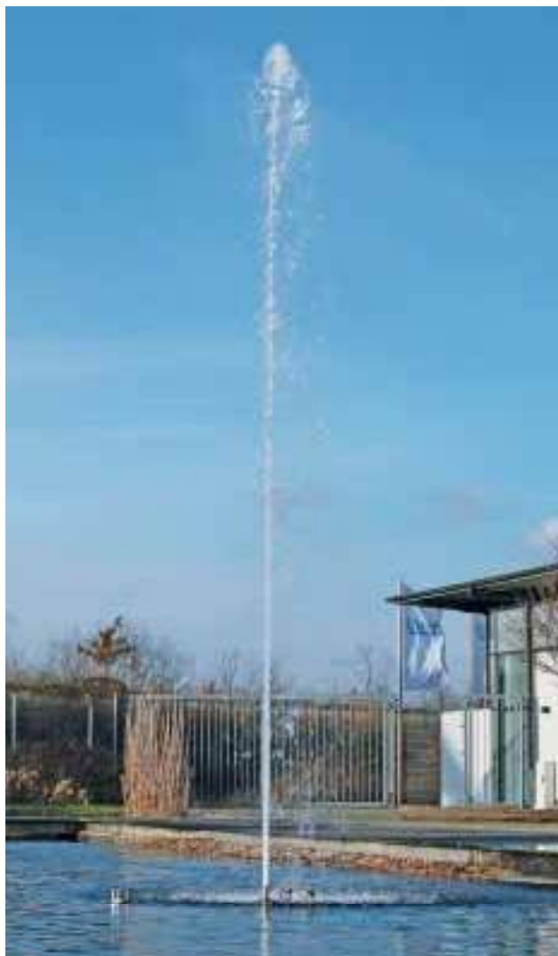
Cluster Eco 15-38